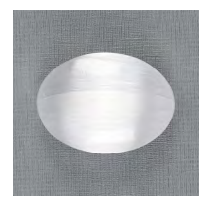
Product Name: Selenite Palm Stone